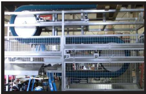
Rinser/Lowerator with adjustable hand crank for standard bottle sizes.